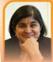
Datto Ambiga Sreenevasan Presidential Address