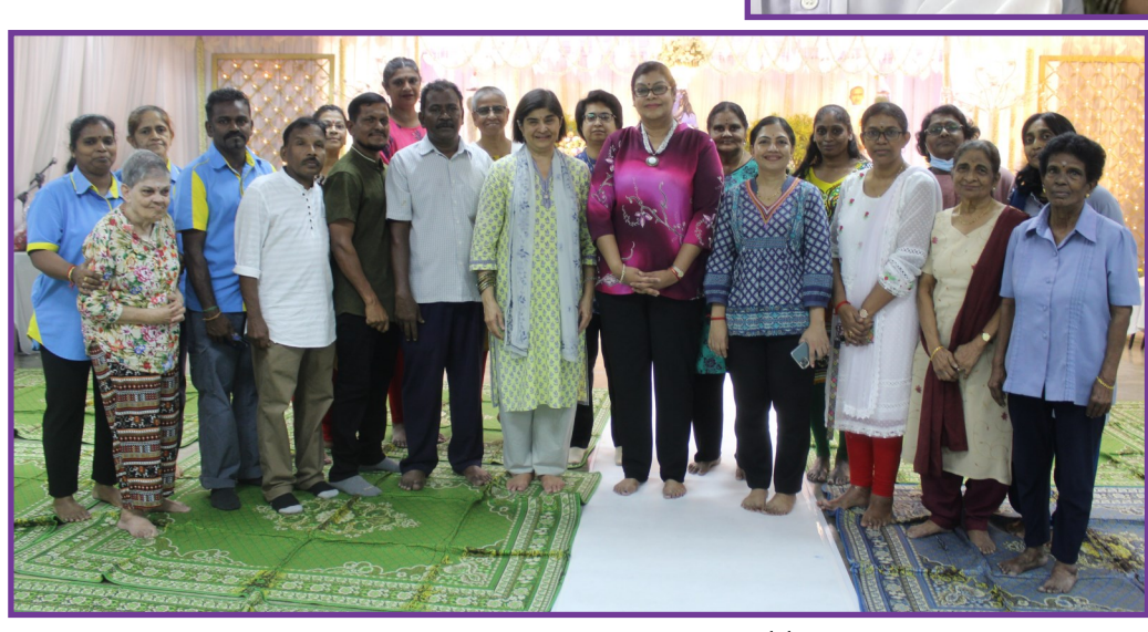
- Management Committee